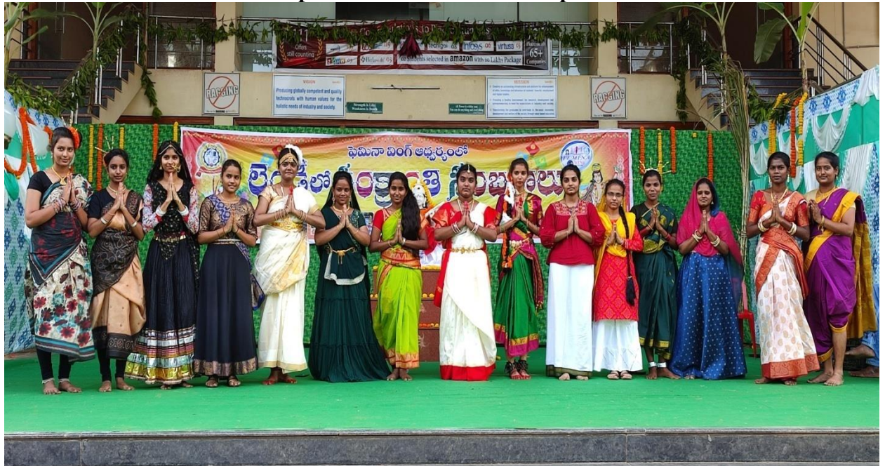
SKIT performed by students with the theme of Epic Ramayanam