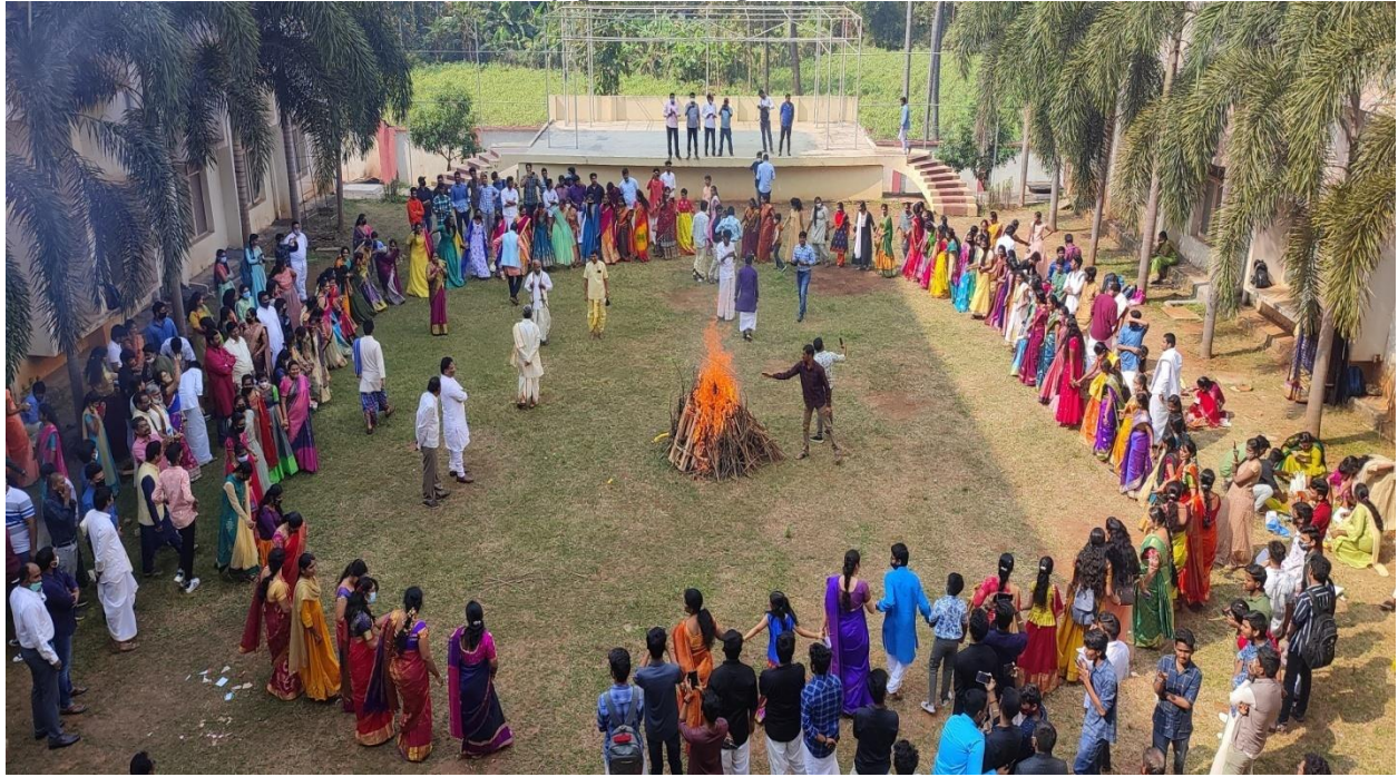
Pot decoration Competition as part of SANKRANTHI Event