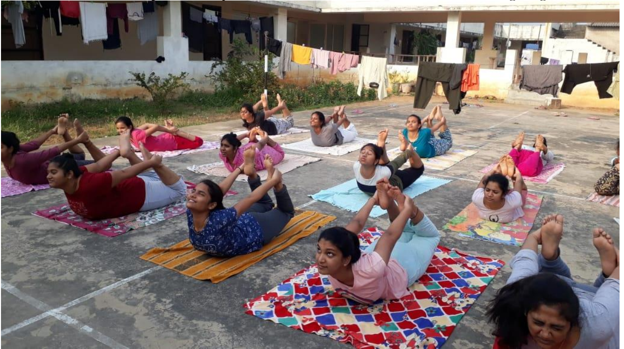
SASANKASANAM performed by Girl students in the YOGA Awareness & Training Programme