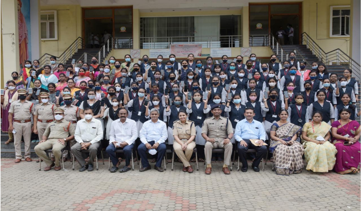
DISHA App awareness Program