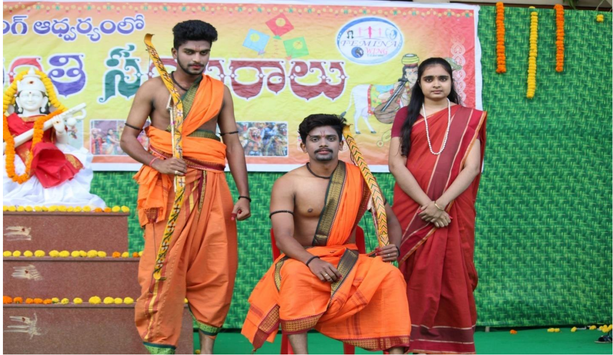
Instrument Musica by students