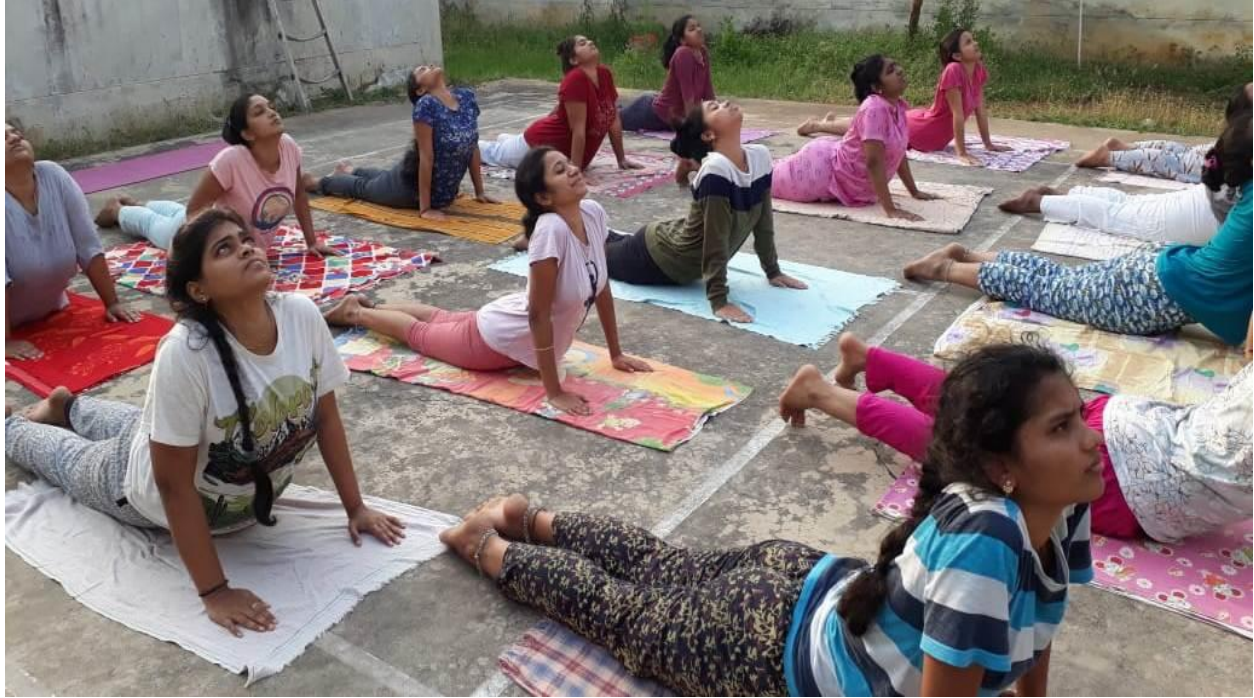
USTRASANAM performed by Girl students in the YOGA Awareness & Training Programme