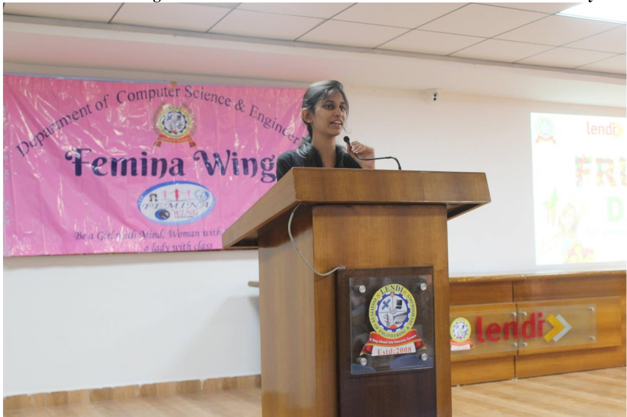
Inculcating Fruit eating habit among students