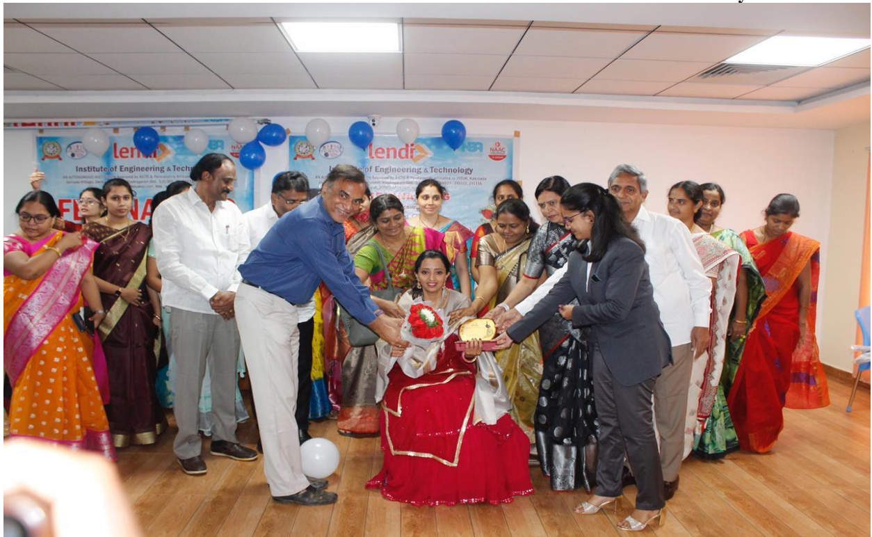
Students and Faculty along with Chief Guest