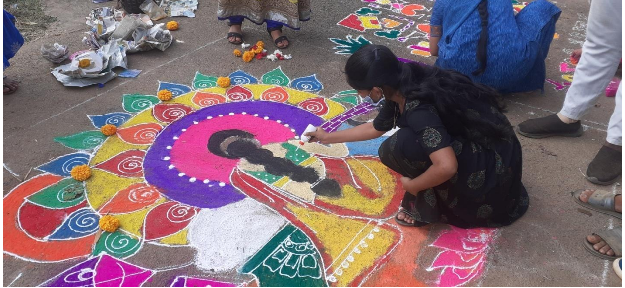
STATE WISE Representation of students as part of Sankranthi Sambaralu